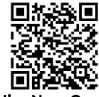
I'm New Card

Please check-in for worship using the Church Center app on your phone, tablet, or at the kiosks in Crossroads and Christian Life Center (CLC). If you are a first-time guest, scan QR code to fill out our I'm New Card .