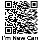
I'm New Card

Please check-in for worship using the Church Center app on your phone, tablet, or at the kiosks in Crossroads and Christian Life Center (CLC). If you are a first-time guest, scan QR code to fill out our I'm New Card .